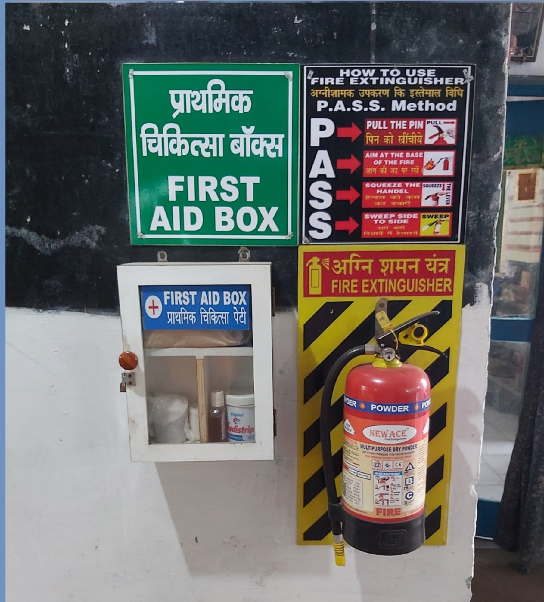
First Aid & Fire Extinguisher